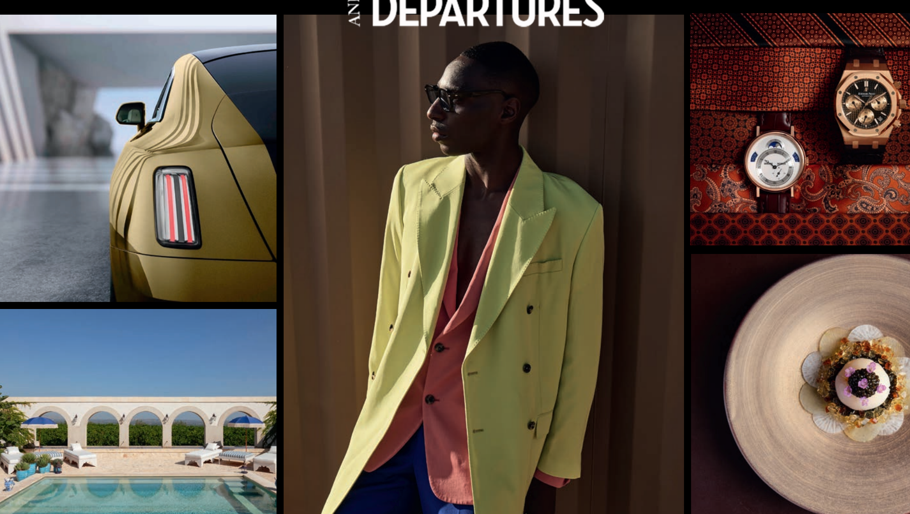
2024 EDITORIAL CALENDAR